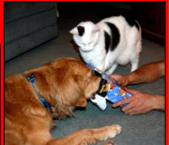
"Christmas means sharing?"