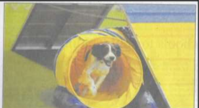
A dog emerges from the tube after climbing up and down the A-Frame on an obstacle course at The Blue Ridge Dog Training Club Agility Trials. The dog competed in the master class, where any mistakes on the course results in disqualification.